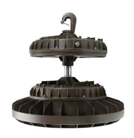
HBM01 (Shown with Emergency Box)