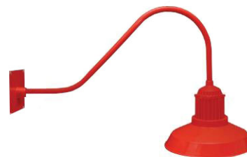
RLMVP w Straight Shade Option