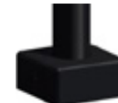
COVER (Comes Standard with Anchored Poles)