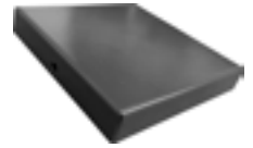
Square Pole Top Cover