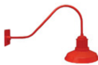
RLMVP w Straight Shade Option